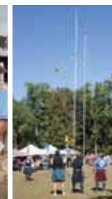
The Winning Sheaf Toss