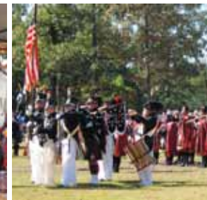
Fayetteville Independent Light Infantry presents arms