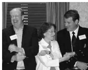
Auld Lang Syne