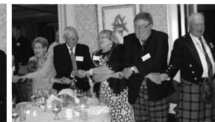
"And here's a hand my trusty fiere"