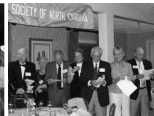
Assembled say thanks